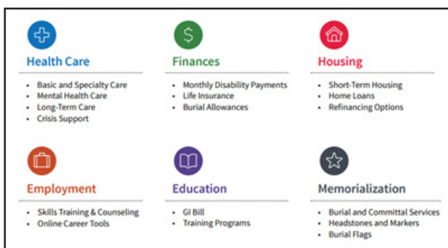
Summary of VA benefits and services

Since its inception, the Department of Veterans Affairs (VA) has continually provided a growing number of diverse services to an increasingly dynamic veteran population. With the passage of the Promise to Address Comprehensive Toxics (PACT) Act in 2022, VA now faces the single largest benefit expansion in its recent history. Today’s VA is not only responsible for offering health, education, disability, funerary, housing and financial benefits to an expanding pool of qualified veterans, but it is also challenged with managing medical facilities and modernization efforts amid the tailwinds of a global pandemic. Thus, the volume and variety of VA’s management responsibilities warrant reflection. Should the VA choose to take on new responsibilities to provide more comprehensive services, or should it focus on its core strengths?