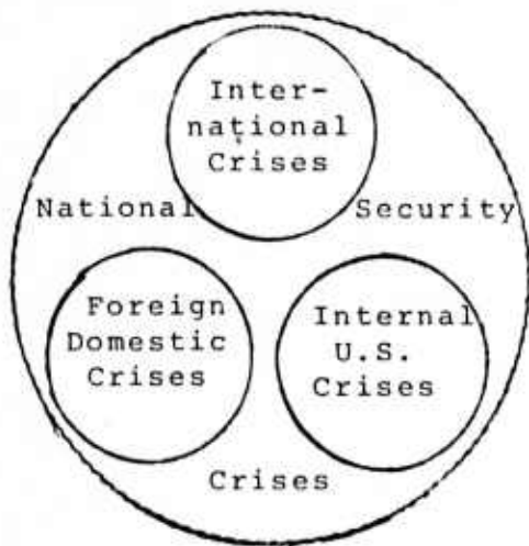
FIGURE 1: National Security Crises

Figure 1 illustrates the threefold classification of national security crises. The subject of the present study is international crises .