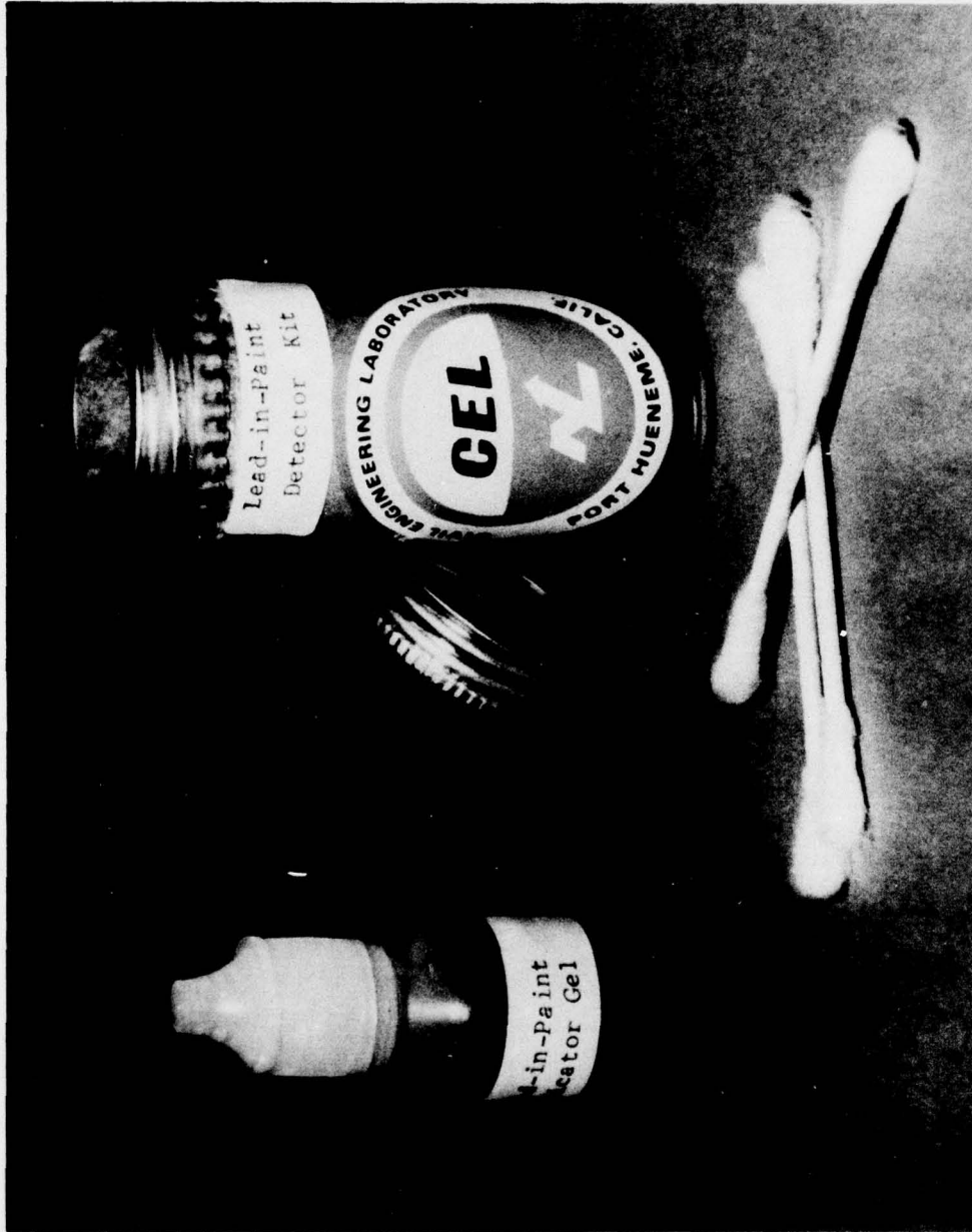
Figure 1. 'Vest pocket', lead-in-paint detector kit.