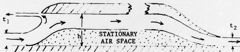
Figure 2 - Underfilled Duct Class

These solutions have the property that the pressure recovery coefficient C_p = 1 - (t_2/h)^2 (which can be derived very simply from one-dimensional fluid mechanics principles). For a given value of C_p , the minimum admissible value of jet area ratio t_1/h corresponds to the filled-duct class. In other words, the filled-duct class is a limiting case of the overfilled duct class. To investigate cases of still smaller jet area ratios, we must adopt a modified flow model. The simplest, in the sense of involving fewest theoretical difficulties, is illustrated in Figure 2.