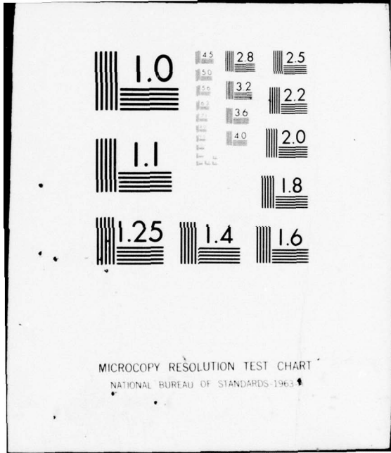
MICROCOPY RESOLUTION TEST CHART NATIONAL BUREAU OF STANDARDS-1963-A