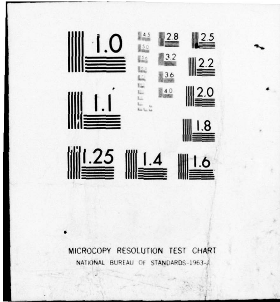
MICROCOPY RESOLUTION TEST CHART NATIONAL BUREAU OF STANDARDS-1963-A