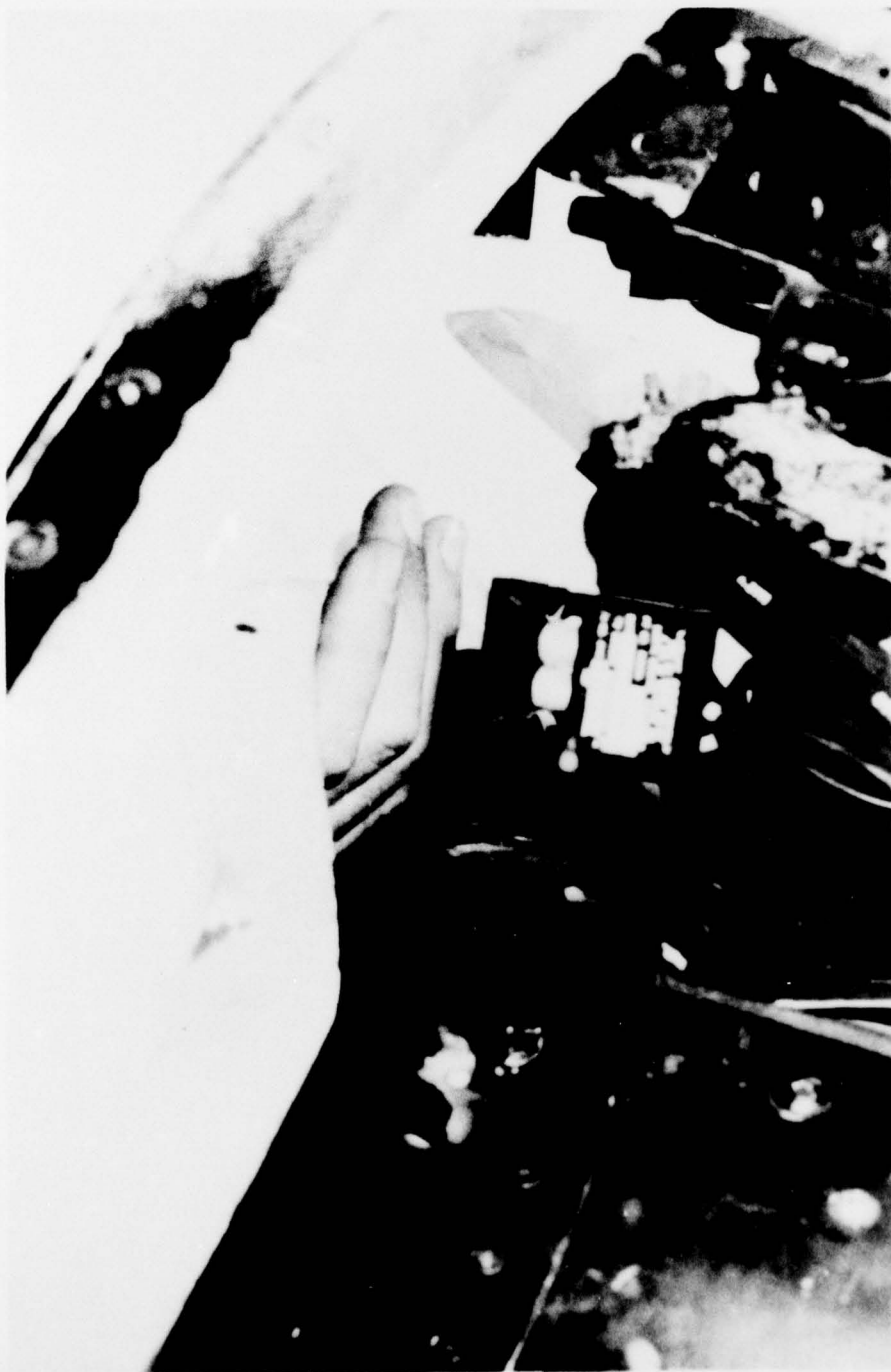
FIGURE 2. TRC Operation, Hand Pressure at Center of TRC.