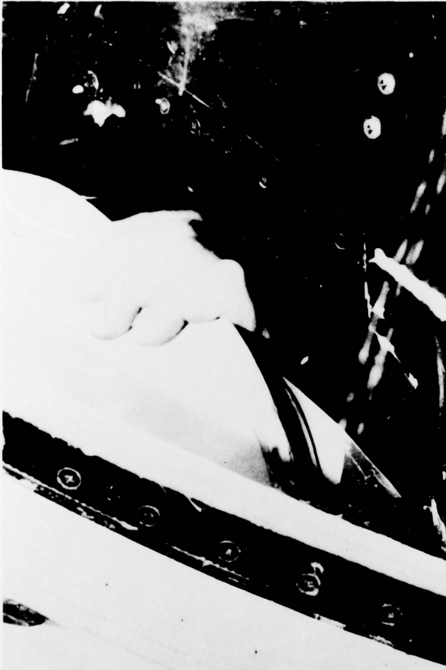
FIGURE 3. TRC Operation, Hand Pressure on Right Side of TRC.