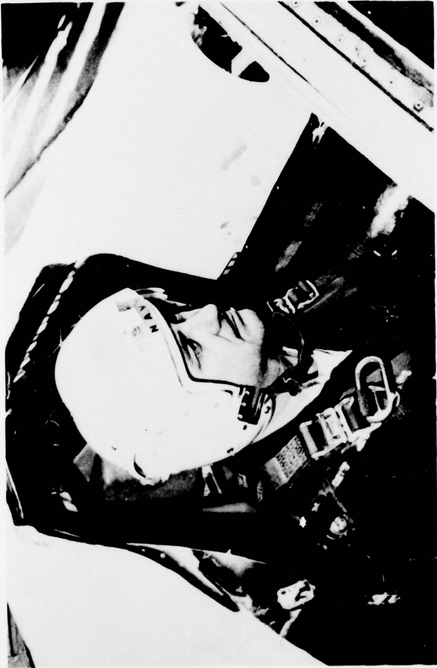
FIGURE 1. TRC in Ready Position, Pilot in Full Flight Gear.