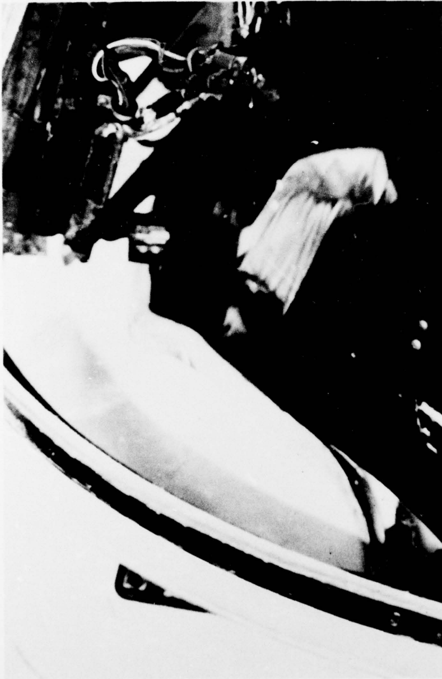
FIGURE 5. TRC Operation, Clearance at First Detent Position.