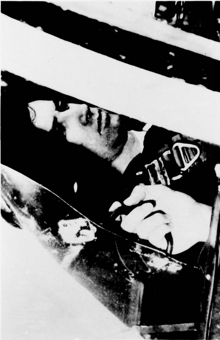
FIGURE 4. TRC Operation, Hand Pressure on TRC Handle.