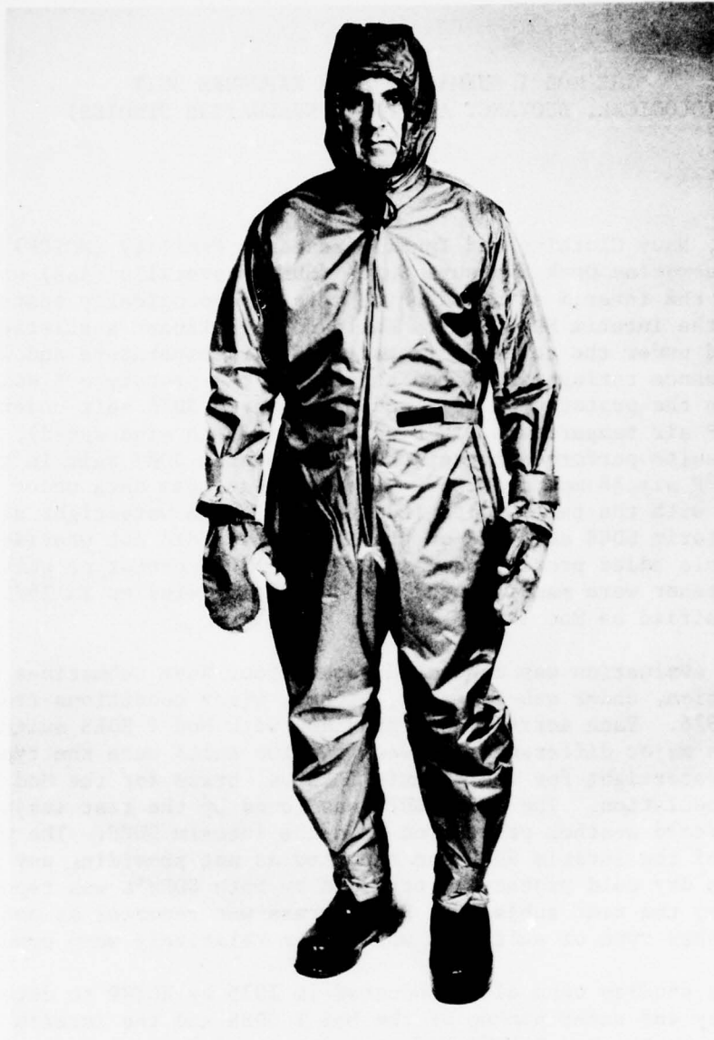
Figure 1. The Navy Submarine Deck Exposure Suit.