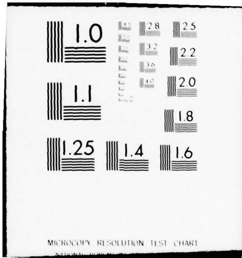
MICROCOPY RESOLUTION TEST CHART