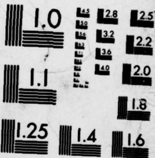
MICROCOPY RESOLUTION TEST CHART NATIONAL BUREAU OF STANDARDS-1963-A