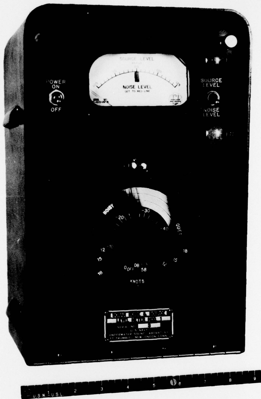
Fig. 1 Sonar Noise and Source Level Meter, Model 1