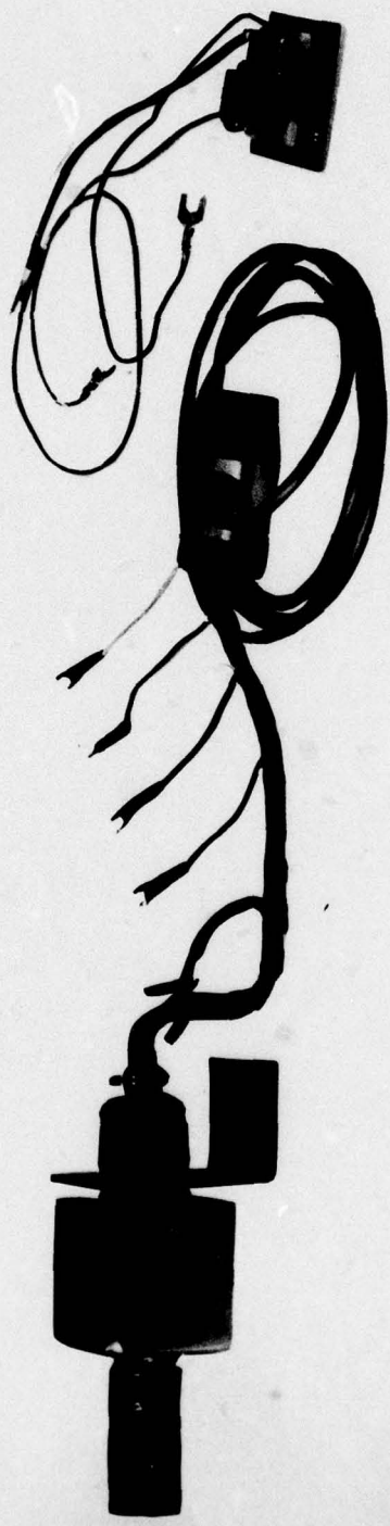
Fig. 4 Sonar Noise and Source Level Meter, Model 1 - Cathode Follower and Voltage Divider