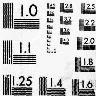
MICROCOPY RESOLUTION TEST CHART NATIONAL BUREAU OF STANDARDS-1963-A