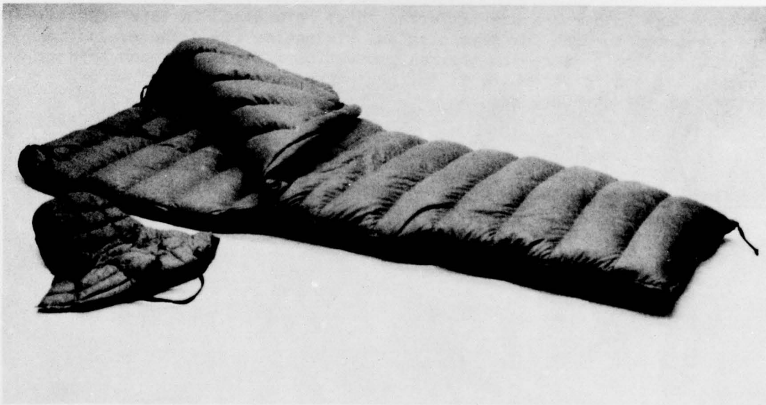
Figure 2. Prototype Survival Sleeping Bag.