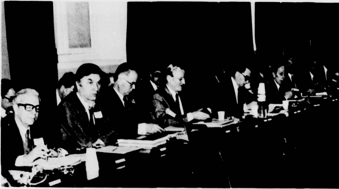
AGARD NATIONAL DELEGATES BOARD in session at its Spring Meeting in Paris, March 1979.

as a complement to the Panels by bridging the gap between emerging technologies and military applications. The results of several of its studies have contributed directly to Task Force 5 on Air Defence as part of the Long Term Defence Programme of the Alliance. 2