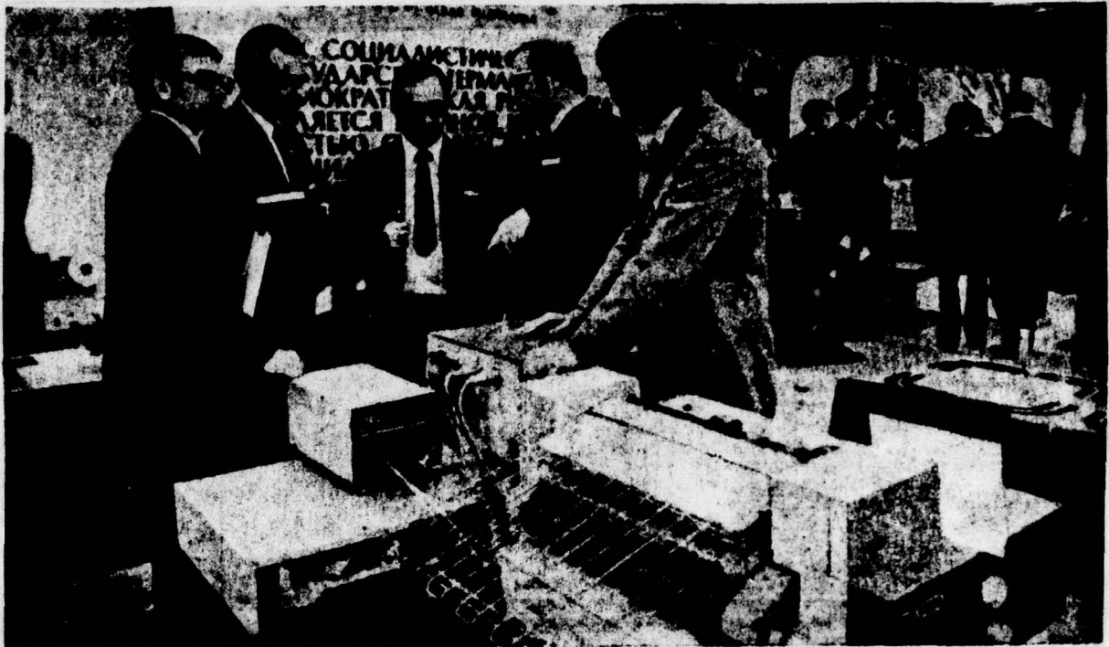
GDR booth at Uniform System exhibition.

ment, has the property of dynamic memory allocation and multiprogram operation on a priority basis. Besides this system the OS creates the possibilities of using more developed and at the same time, efficient translators of programming languages and service programs, receiving extensive information for each program during multiprogram use and considerable simplifications during operations actuating the programs.