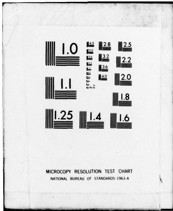
MICROCOPY RESOLUTION TEST CHART NATIONAL BUREAU OF STANDARDS-1963-A