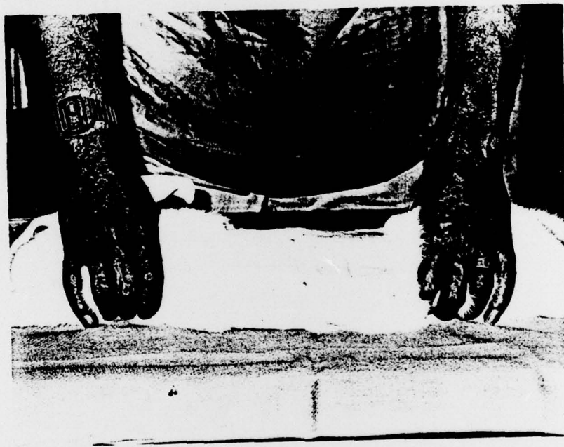
Fig. 2 Rabbit examined 24 hours post-exposure. Note the three erythematous zones overlapping the area of application of the blocking agent.