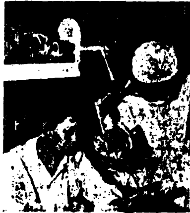
CO 2 laser medical unit used in burning operation

CO 2 and YAG lasers are effective in the burning and cutting of tumors in the oral and facial regions. They are effective especially in treating vascular tumor in these places because the conventional radiation method, cryosurgery, and hardener injection are all less than satisfactory. Ordinary surgical removal often causes functional disability or abnormality. Laser treatment is not only clinically sound but also leaves no functional disability problems and keeps the integrity of the facial shape.