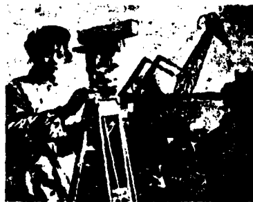
[Photo Caption] Laser transit theodolite used in ship building industry.

Using laser as a straightness standard has been fairly common in China. Because of the unique character of highly directional, laser provided people with a straight edge which is not bothered by wind or rain. Industry has made good use of various laser rechlorine apparatus, laser transit theodolite, and laser direction finder. They have been used in heavy equipment assembly, sectional building of large ships, assembly of airplane skeleton structure, construction of tall buildings, bridge building, road construction, laying underground pipes, subways, drilling of tunnels, underpasses, and coal mining.