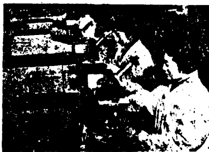
Photo Caption: Production line processes jewel bearings for clocks and watches using laser to drill holes.

Research on industrial applications began shortly after the successful development of the first ruby laser in China. In 1963, the first demonstrator of a ruby laser hole marking machine appeared in an exhibition in Beijing and attracted interest and attention. In the Chinese clock and watch industry, Shanghai Clock and Watch Plant first made use of laser in their processing work of jewel bearings in 1965 and, after test production runs, the procedure was finally adapted in production and played an important role in it. The photo below shows the jewel bearing production in a factory using laser in hold drilling.