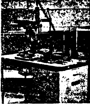
Model JG-75-1 iridectomy machine

CO 2 and YAG lasers are effective in the burning and cutting of tumors in the oral and facial regions. They are effective especially in treating vascular tumor in these places because the conventional radiation method, cryosurgery, and hardener injection are all less than satisfactory. Ordinary surgical removal often causes functional disability or abnormality. Laser treatment is not only clinically sound but also leaves no functional disability problems and keeps the integrity of the facial shape.