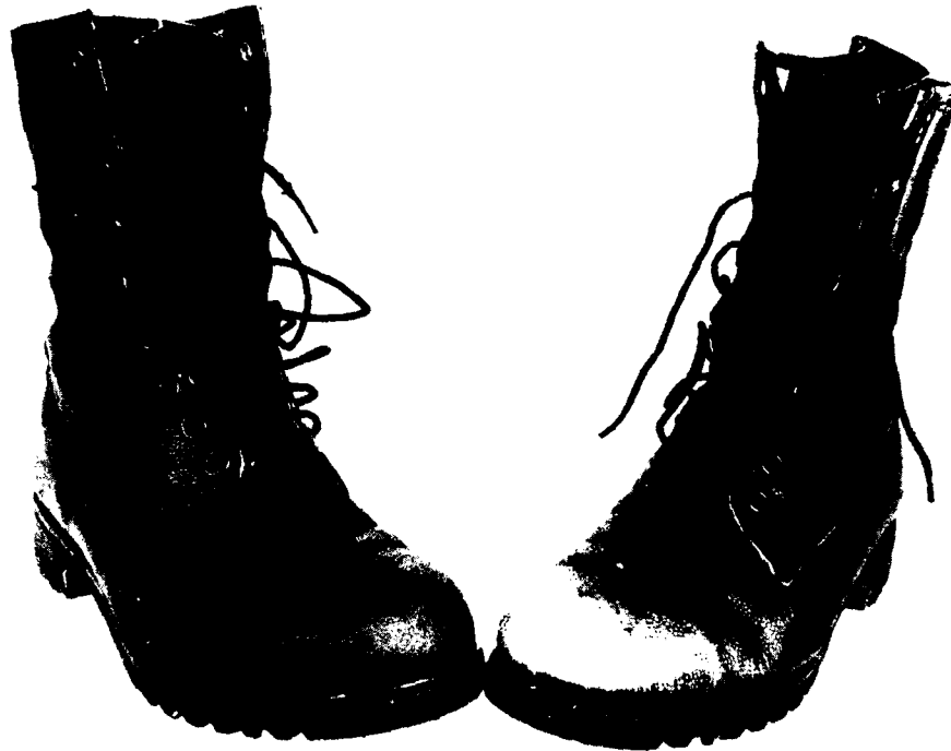
Figure 2: The boot on the right has been worn for three, 30-minute tests through grass. The boot on the left has been coated with silicone after these three, 30-minute tests.