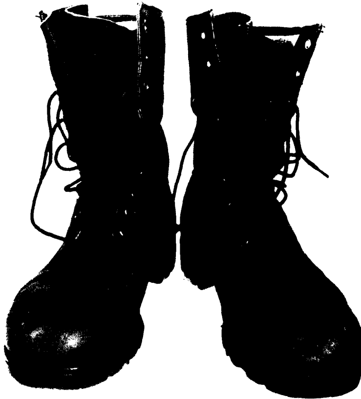
Figure 3: The boot on the right has been worn for three, 30-minute tests through puddles. The boot on the left has been coated with silicone after these three, 30-minute tests.