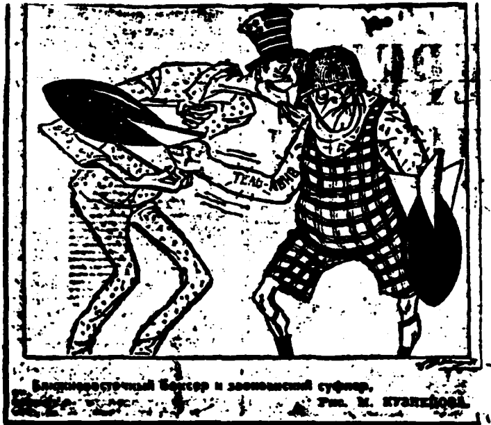
Middle Eastern Boxer and His Overseas Manager.