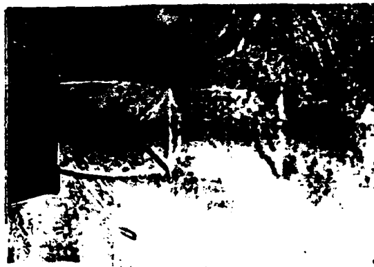
Figure 2. A laser schlieren photograph of shock waves (pressure waves similar to a small sonic boom) in a very high speed round jet. The pressure waves include oblique (angled) shock waves and curved shock waves due to the particles which can be seen in the center of the flow. Without particles the oblique shock waves are at a different angle and the curved shock waves are straight. The shock waves are visible because light traveling through the shock wave changes direction and the photograph is not exposed and appears dark where the shock wave is located.