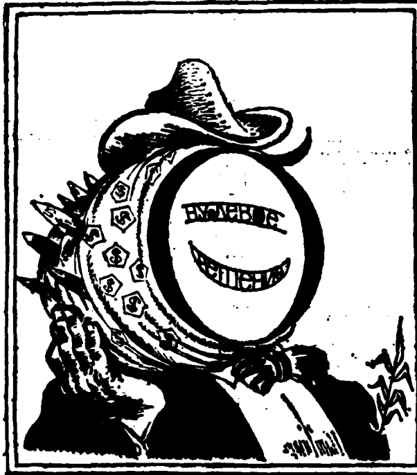
Ядерный флюкс дяди Сэма.