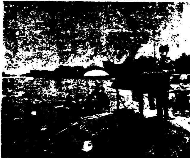
Flight control point located near the freeway.

We leave the city behind, the roadway is not very wide, with a cobblestoned surface, and leading through the forest. Around a turn, the major points out a place where a drama was played out that had a lucky ending, the drama of a pilot. It happened recently, and the major was an eye witness of this lucky event. A Mig 21 with a