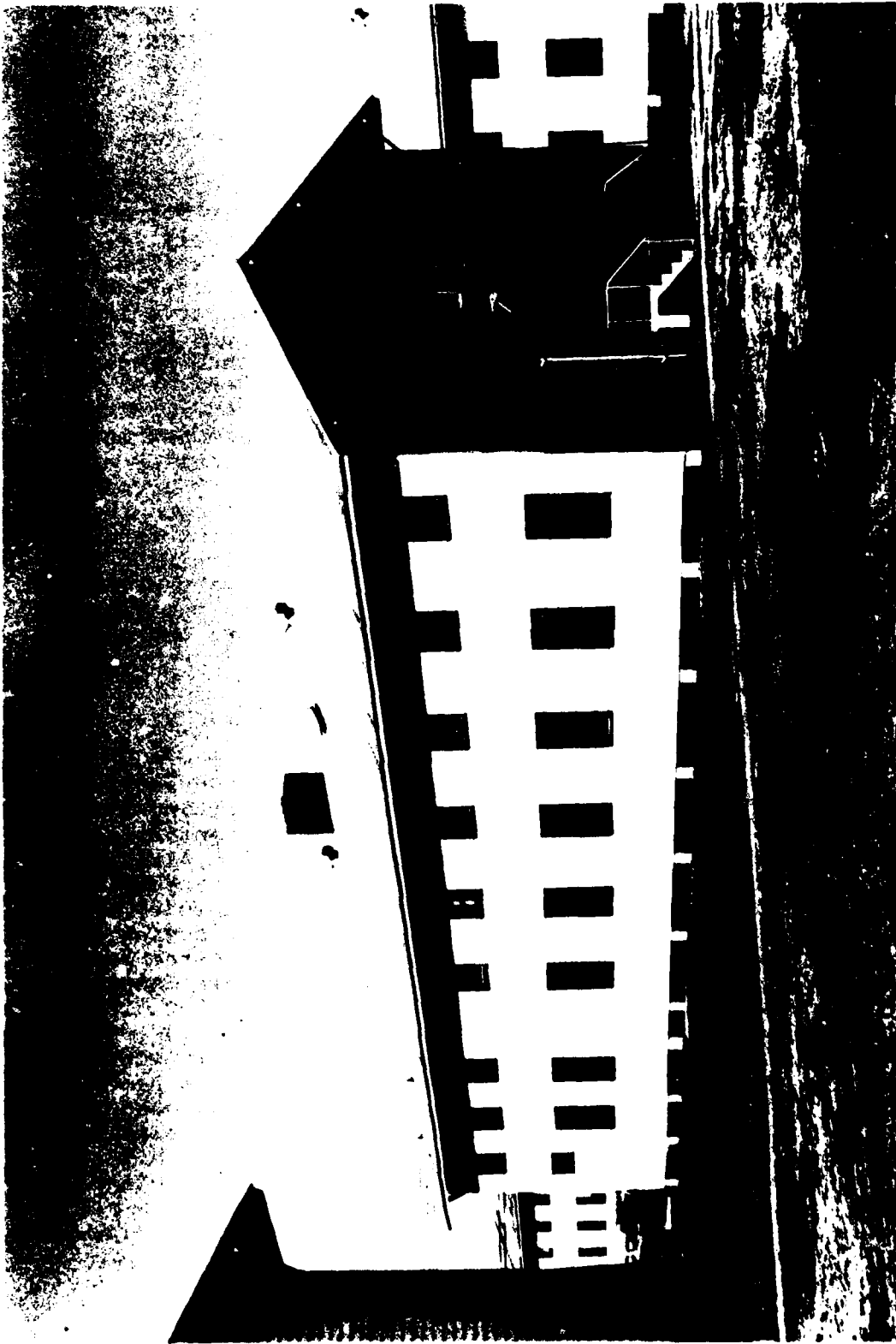
BARRACKS BEING MODERNIZED AT FORT RUCKER