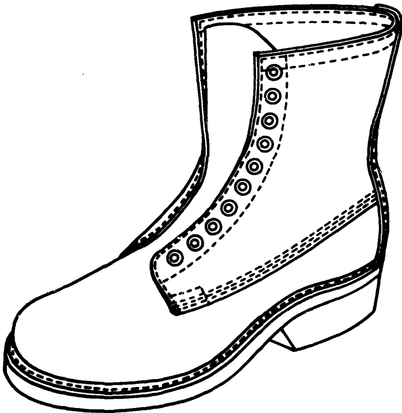
FIGURE 1. STANDARD SAFETY BOOT