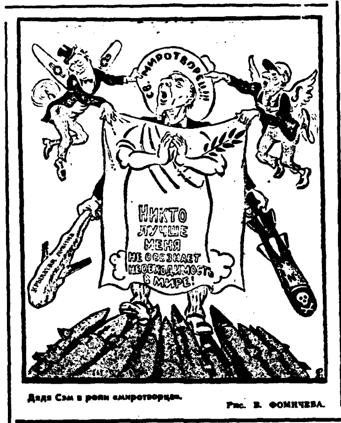
Uncle Sam in the role of "Peacemaker".