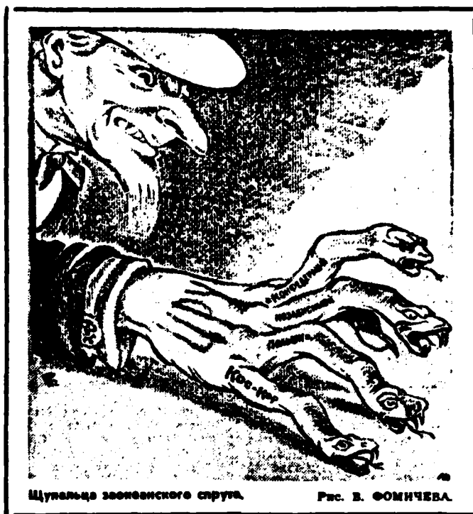
"Tentacles of the overseas octopus." (The CIA continues anti-Polish activities through the Confederation of Independent Poland.)