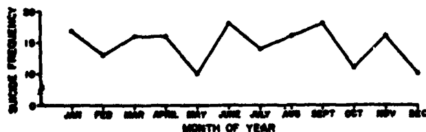
Fig. 3. Frequency of suicide by month of year, 1979-1980.

The annual suicide rate per 100,000 soldiers-at-risk fell more than three points from 1977-78 to 1979-80. This drop represents an emphasis in the continued downward trend