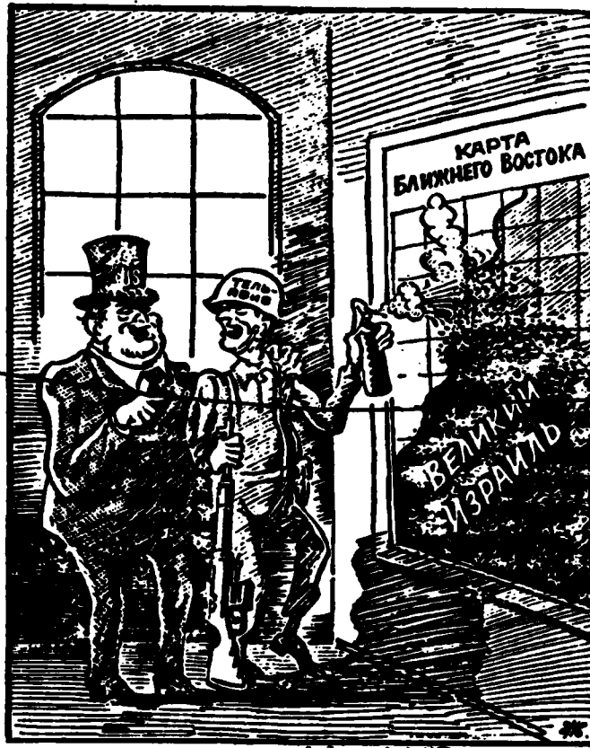
«Картограф» из Тель-Авива.