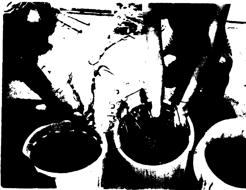
Figure 5. Placing the planting units into containers for transport to the planting site.