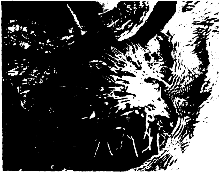
Figure 2. Plant collection.