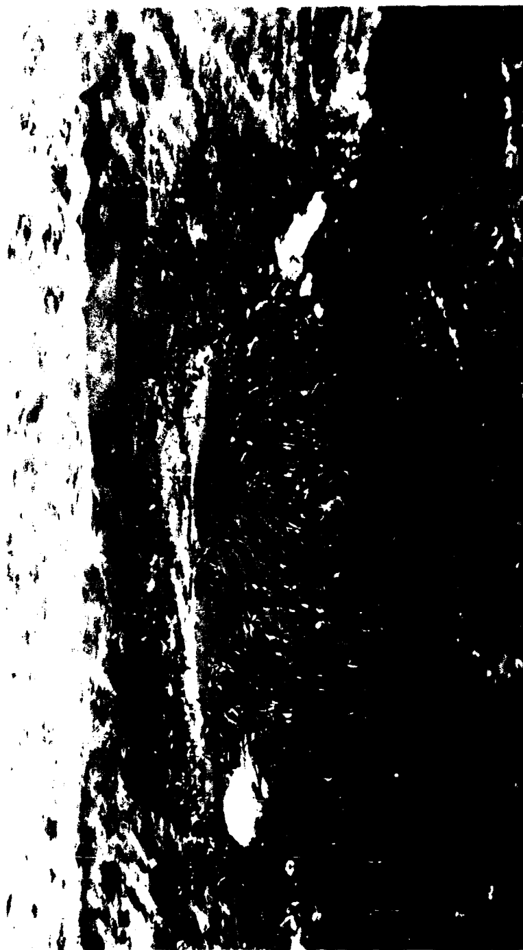
Figure 1. A photo of a high current area eelgrass meadow at low tide. Note the isolated and mounded nature of the meadow. The scale of the vegetated area is 1 meter.