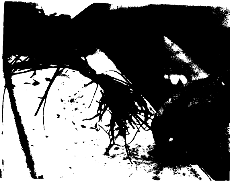
Figure 4. Attachment of anchor and fasteners; one planting unit.