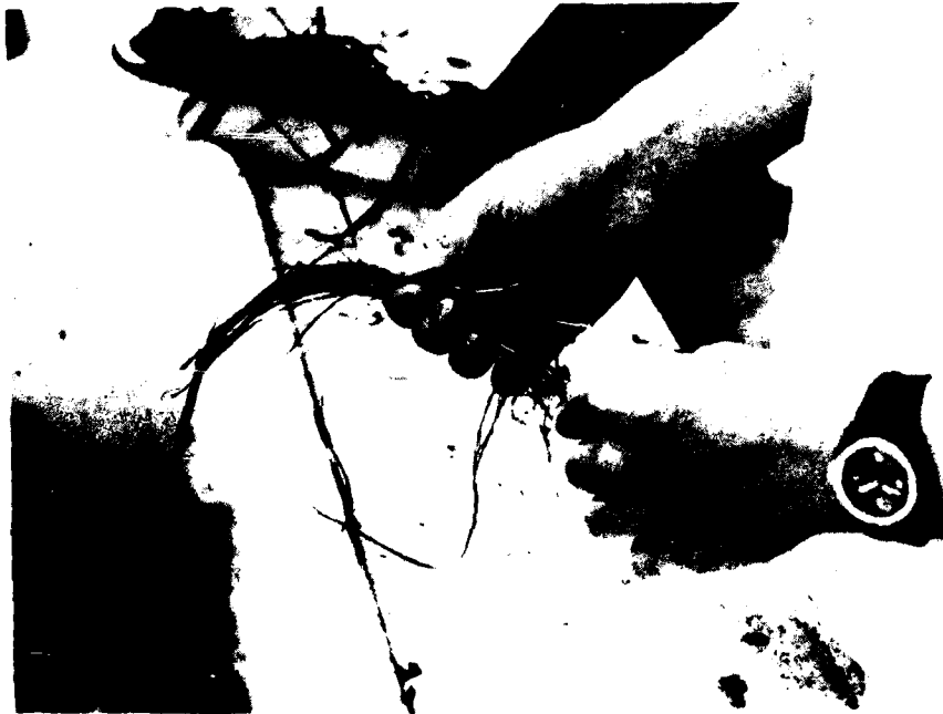
Figure 3. Isolating the proper number of shoots per planting unit.