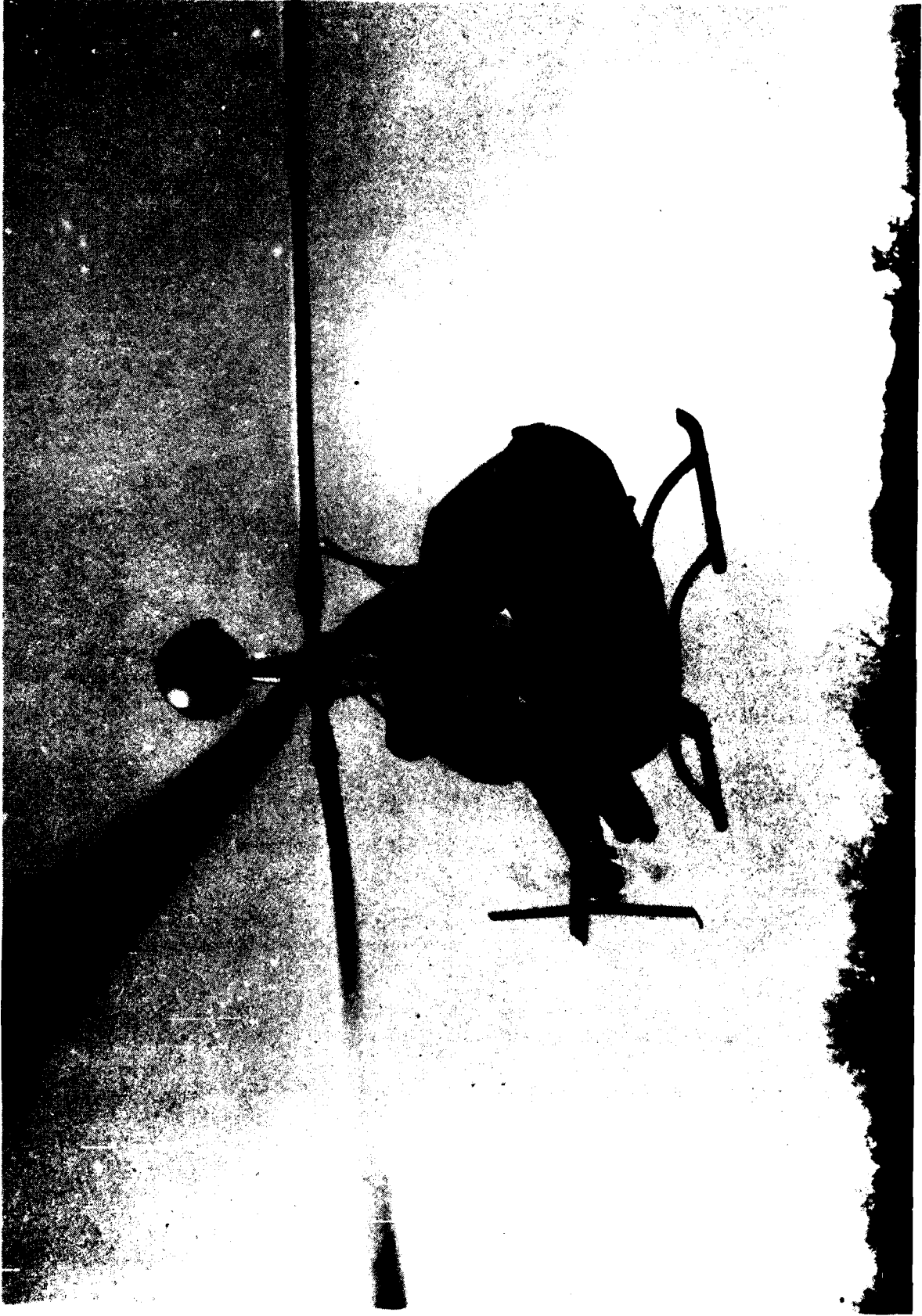
The Army's AHIP Scout