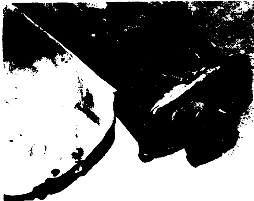
Figure 1. Muffler from a single engine aircraft. Note the split in the muffler and the discoloration caused by exhaust gases as they contacted the wall of the cabin heat exchanger shroud. The pilot was incapacitated in flight by carbon monoxide and killed in the crash that followed.

Case 2. The pilot, the only occupant of a Piper TriPacer, departed a local airport at 1700 on a cold December afternoon for the purpose of practicing touch-and-go procedures. The flight before the fatal accident was of 30-minutes' duration. The crash occurred in a wooded area adjacent to a large open field. The plane descended into the trees at a shallow angle paralleling the border of the open field. No autopsy was performed on the pilot but blood was submitted for toxicological analysis. A carboxyhemoglobin level of 23 percent was found. The pilot had been thrown free of the burned aircraft and gross injuries suggested that he died immediately after the crash. The finding of an elevated CO saturation prompted close inspection of the exhaust and heater system. Investigators found a cracked exhaust muffler and staining of the heat exchange shroud by the exhaust gases (Figure 1). The