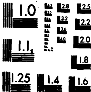
MICROCOPY RESOLUTION TEST CHART NATIONAL BUREAU OF STANDARDS-1963-A