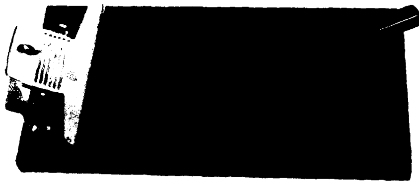
FIG. 2 Photograph of the K Hand Coater and impression bed used to prepare the thin films.