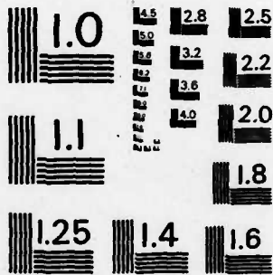
MICROCOPY RESOLUTION TEST CHART NATIONAL BUREAU OF STANDARDS-1963-A