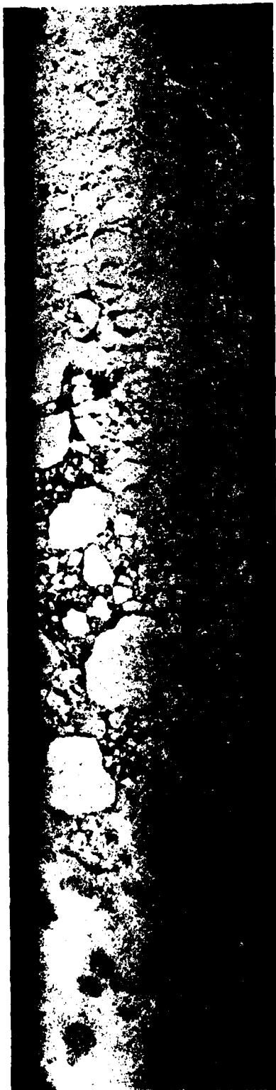
Figure 11. Ice in the Coronation Gulf area, NWT (orbit 780). SAR Imagery. Ice free water is at the right of the picture.

range scale 1:820,000 azimuthal scale 1:770,000