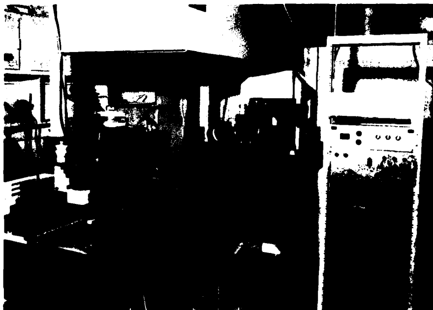
Figure 1. The DREO optical correlator for the SEASAT-A SAR data