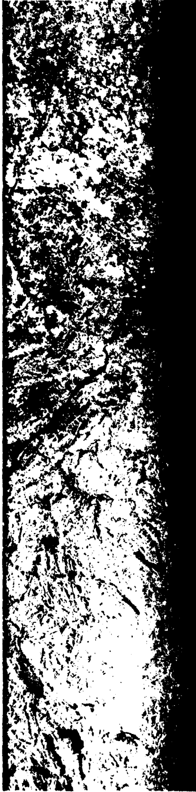
Figure 7. The Ottawa-Hull area (orbit 472). SAR Imagery