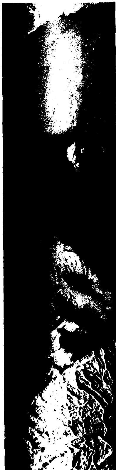
Figure 9. Weather features on the surface of the St. Lawrence River (orbit 1447). SAR Imagery range scale 1:820,000 azimuthal scale 1:820,000