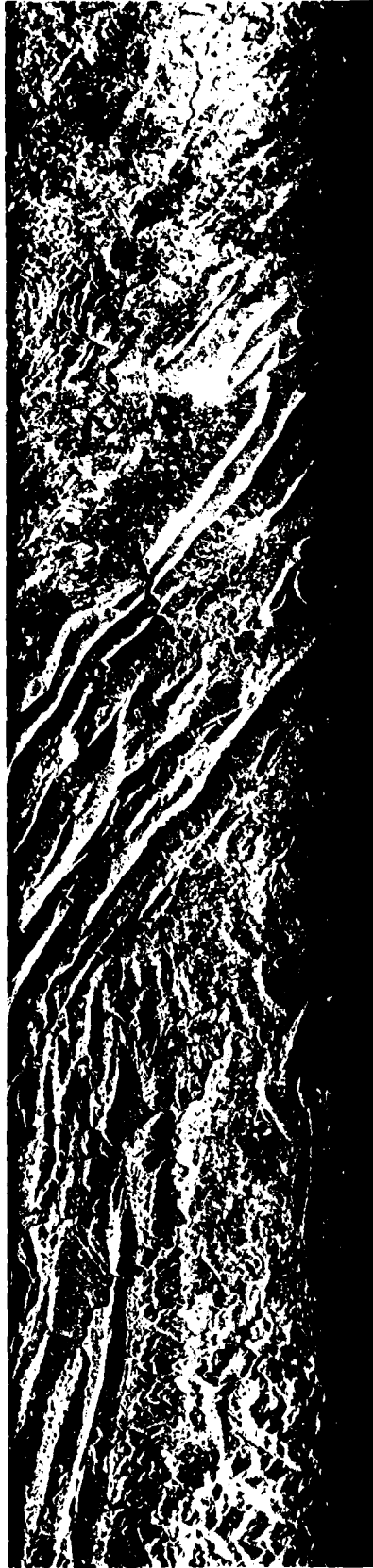
Figure 6. Allegheny Mountain (orbit 472). SAR Imagery