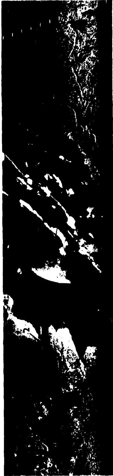
Figure 10. The Coronation Gulf area, NWT (orbit 780). SAR Imagery