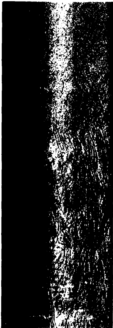
Figure 3. Standing waves in the Pacific Ocean, West of Guatemala (orbit 472). SAR Imagery