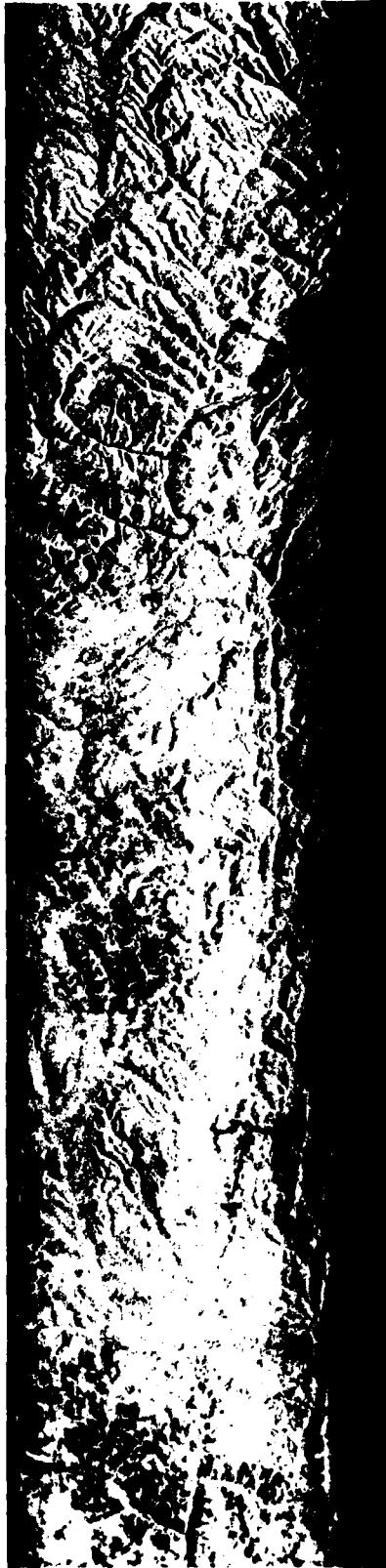
Figure 8. Baie des Chaleurs area, Gaspé (orbit 1447). SAR Imagery