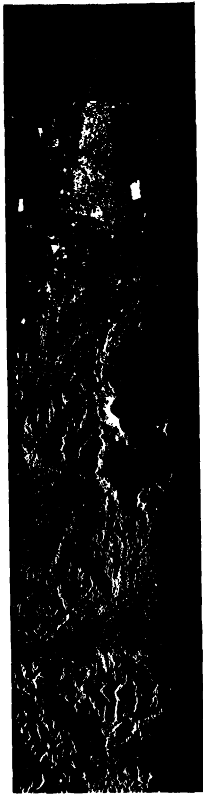
Figure 4. West coast of Guatemala (orbit 472). SAR Imagery