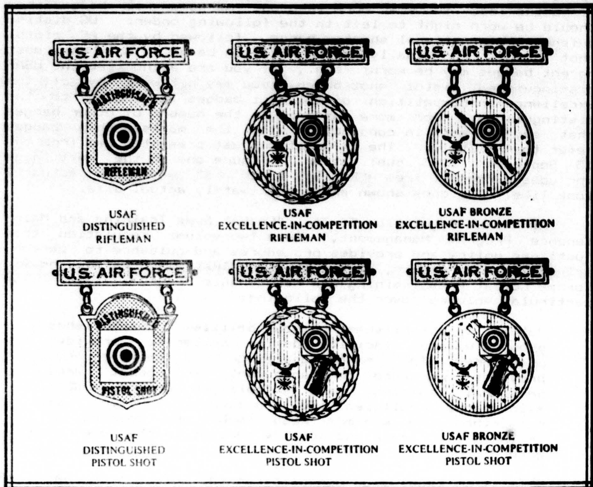
FIGURE 1: USAF Excellence-in-Competition Badges (2:192)

you will be working with highly skilled experts from the marksmanship training unit. However, there are sections that would probably be worthwhile reading, in particular the ones dealing with range procedures and range safety. It is important to emphasize that during an elementary competition many of the participants will be completely unfamiliar with either procedures or safety; therefore, as project officer, be sure you understand what is happening before the match begins. Also, the regulation contains some good diagrams of the various shooting stances that may be used during a match. It might be a good idea to have some of the appropriate drawings reproduced and on hand during the competition to use as examples.