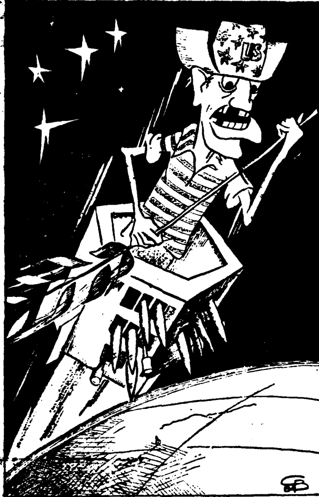
Космическое завтра по-американски.

Прикрываясь заявлениями о своей миролюбивости и готовности к переговорам, администрация Рейгана продолжает наращивать гонку вооружений, добиваться военного превосходства, идти по пути милитаризации космоса. (Из газет).