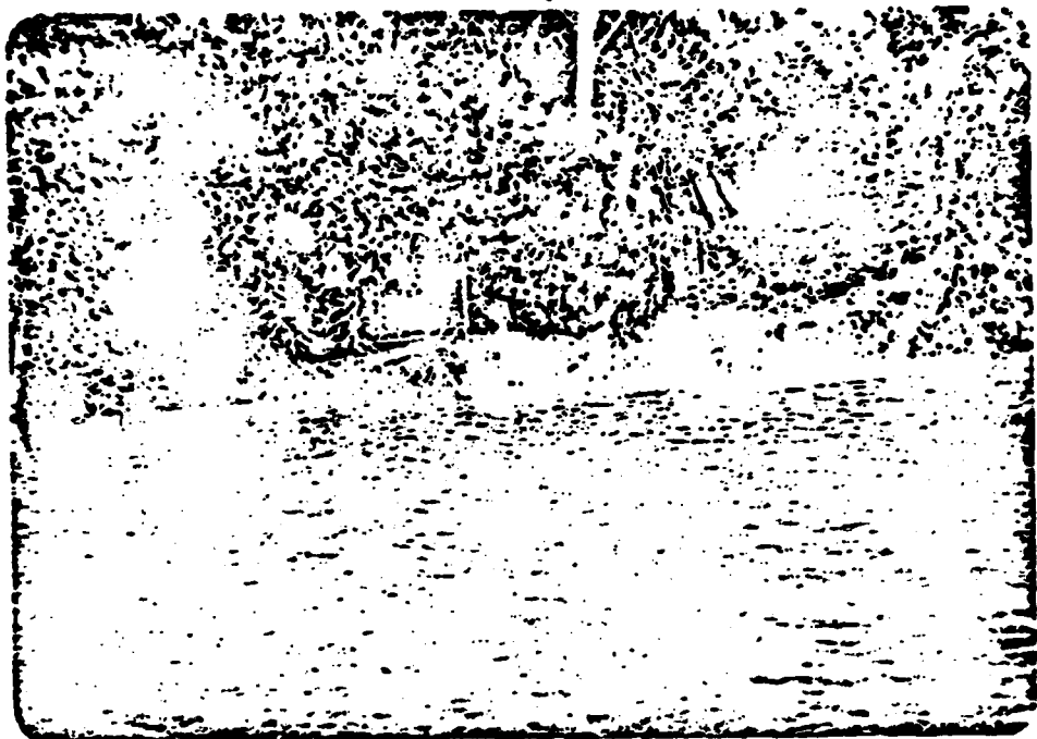
Plate #1 - West Bank of Island 42 in the Vicinity of the Proposed Right-of-Way