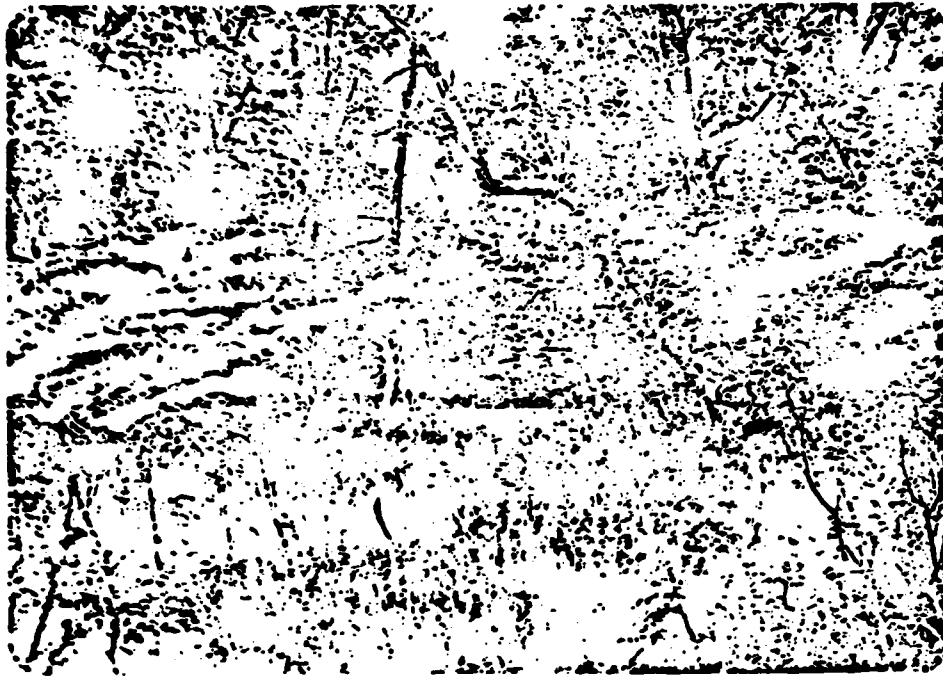
Plate #3 - A Portion of the Proposed Right-of-Way on Kruger Slough