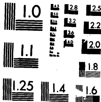
MICROCOPY RESOLUTION TEST CHART NATIONAL BUREAU OF STANDARDS-1963-A