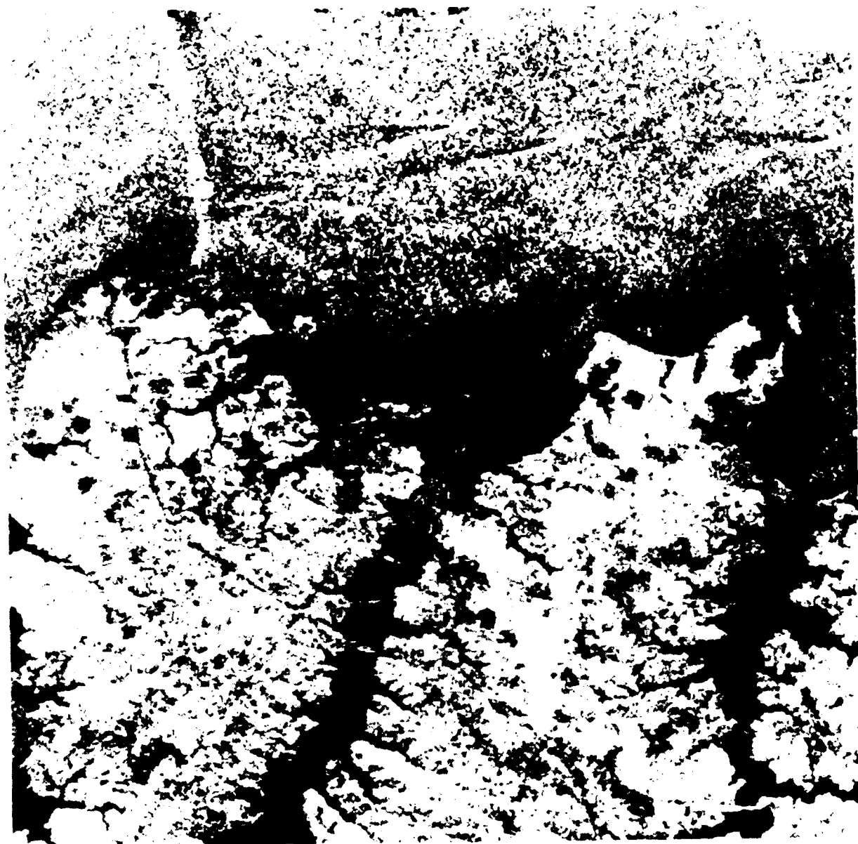
Fig. 1a — Seasat-A SAR image of Chesapeake bay on Aug. 5, 1978