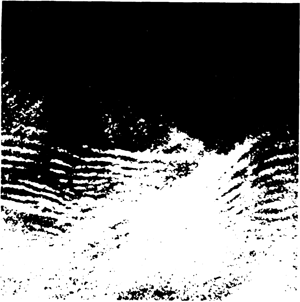
Fig. 3a — SIR-B image of ocean surface at New York/Hudson canyon area.