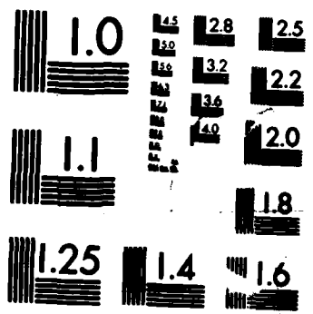
MICROCOPY RESOLUTION TEST CHART NATIONAL BUREAU OF STANDARDS-1963-A