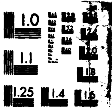
MICROCOPY RESOLUTION TEST CHART NATIONAL BUREAU OF STANDARDS-1963-A