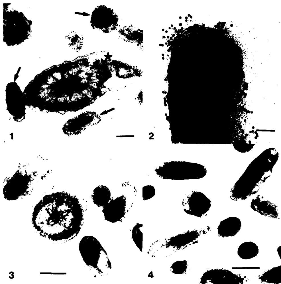
FIG. 1.--Thin-section of C. burnetii embedded in L R White resin. Immunolabelling of LPS-I on cell wall of SCV (arrows). Note absence of labelling on LCV (*). Bar = 250 nm.