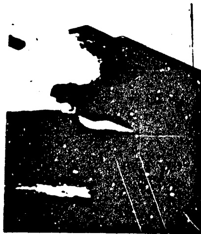
Fig. 3. The most recent multi-barrel rocket launcher system (MLRS) provided by the U.S. Army. The dual chemical rocket projectiles developed by the Army will be distributed to the units in the early 1990's.

chemical warhead. Recently, the American Army has designated the XM-135 dual chemical warhead as one of the critical development projects in its dual chemical planning for the near future. It is anticipated that this warhead will go into production in the early 1990's.