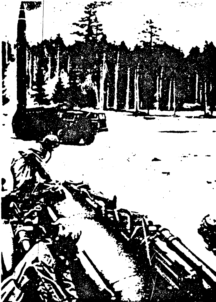
Fig. 1. One-third of Soviet tactical missiles are equipped with chemical warheads. This is a "Fleetfoot-B" missile so equipped.