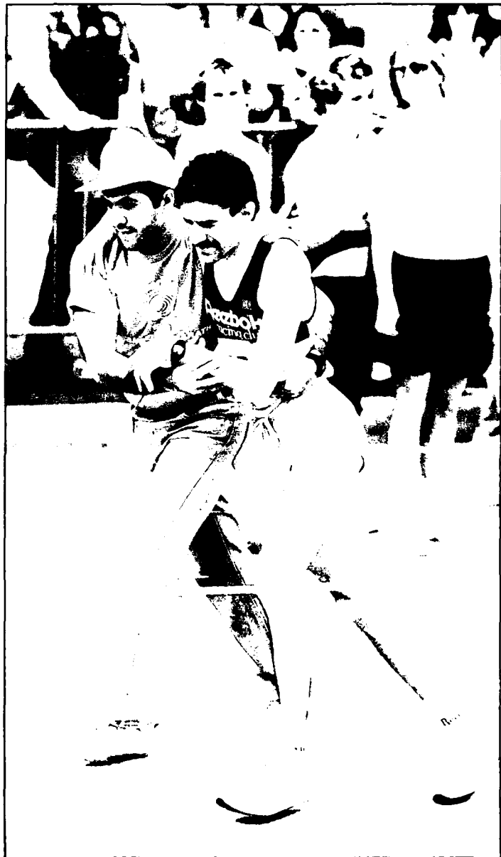
Some degree of heat illness may strike runners during warm weather. Affected athletes should stop activity and lie down; the body should be cooled and fluid/electrolyte deficits replaced.

In brief: This article reviews the causes and treatment of the common heat illnesses—heat syncope, heat exhaustion, and exertional heatstroke. The authors discuss the effectiveness of cooling heatstroke victims in ice water vs water that has been cooled to a temperature of 15° C. The latter method is more practical and has been found as effective as cooling with ice water. The authors also present the energy depletion model, which shows the cycle that results in reduced exercise/heat tolerance and significant morbidity and mortality in victims of exercise-induced hyperthermia. This model predicts that cellular/metabolic processes and deficits operate for some time after hyperthermia has subsided with cooling.