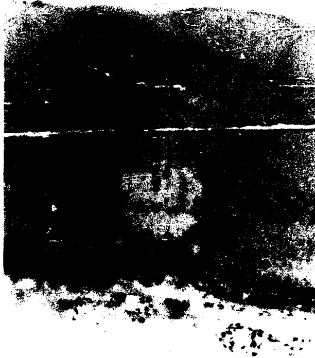
FIGURE 2 Section through pigeon retina harvested 1 hour after exposure to an argon laser beam at 7 times the ED_{50} for an ophthalmoscopically visible lesion. Note edema and rarefaction of nerve fiber layers and vacuolation of nuclear layers. (Artifactual wrinkling of the tissue on the slide obscures some features.) Two micron section, original magnification 125 \times .

spaces appeared to be maintained. There was disruption of the retinal pigment epithelium and the outer limiting membrane was collapsed inwards. There were occasional discrete spaces in the outer nuclear layer at areas away from the area of maximum damage. In areas in which the photoreceptor cells were absent, occasional macrophages were present.