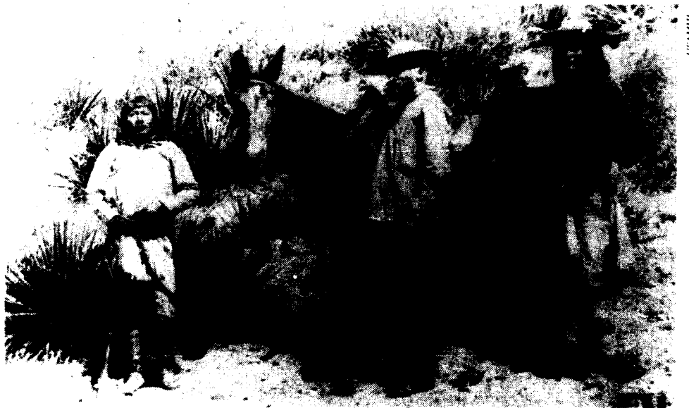
Brigadier General George Crook is pictured with two Apache scouts. He employed the highly mobile scouts to fix Apache hostiles in actions in Arizona in 1882-83, then relied on dogged pursuit to wear down and defeat the enemy.

Essentially, the problem with conventional tactics was that normally the Army was not sufficiently mobile to bring the Indians to battle. Time and again, cavalry and infantry would trail hostile bands for weeks but fail to get them to stand and fight. An excellent example of this sort of futile campaign was that led by Major General Hancock against the Southern Plains tribes in April 1867. Hancock was in command of a force of approximately 4000 soldiers consisting of 11 troops of the 7th Cavalry, seven companies of the 37th Infantry, and a battery of the 4th Artillery. Initially he attempted to negotiate a peace treaty with a large band of Cheyenne and Oglala Sioux. When these attempts failed, Hancock attacked the villages only to discover the lodges were empty. He immediately gave pursuit and followed the hostiles