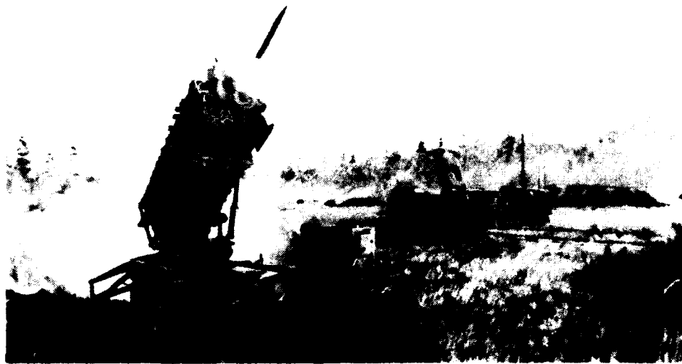
Strategic Defense Command

This increasingly long-range ballistic missile threat will have important consequences for theater missile defense. First, the missiles will address much larger geographic areas, threatening US bases and allies much farther from the missile-armed state. Second, longer-range missiles have much higher reentry speeds, which effectively reduce the area protected by short-range defensive systems such as the Patriot—i.e. many more Patriots are required to defend an area of given size or collection of assets against longer-range missiles. Third, the coupling of long-range missiles with chemical, biological, or nuclear warheads means that devastating damage could be inflicted on a target country with only a very small number of missiles. This means that more effective, longer-range interceptors are required, and also argues for a multi-tier defense composed of two or more weapon types. Moreover, a Third World terrorist missile strike may come with little warning, so that strategic warning times needed for the deployment of surface-based defensive systems must be very short.