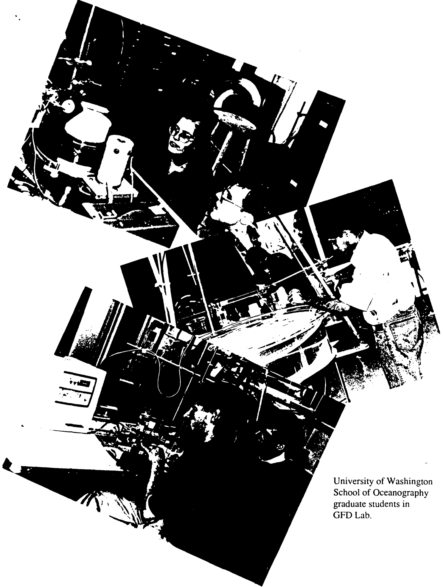
University of Washington School of Oceanography graduate students in GFD Lab.