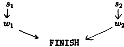
Figure 2: A safe but incomplete nonlinear plan

treating the modal truth criterion as a nondeterministic procedure, as is done in TWEAK, destroys the systematicity of the search — the choices in the modal truth criterion (the disjunctions and existential quantifiers) do not correspond to dividing the space of partial orders into disjoint sets (the same partial order can be reached through different branches in the modal truth criterion). Even if one did systematically search the space of partial orders on step names, different orderings of step names can correspond to the same ordering of actual operations. This implies that, unlike the procedure given here, the search would still not be a systematic search of operation sequences.