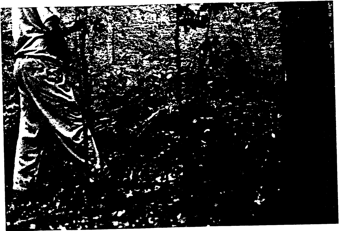
Figure 2. Portion of limestone block mound at mapped location of 15Hd184, looking west.